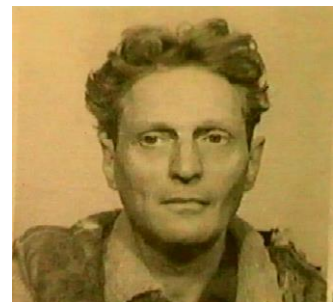
Mug-shot of Late Reverend Richard Wurmbrand when held in the Jilava prison, in communist Romania.